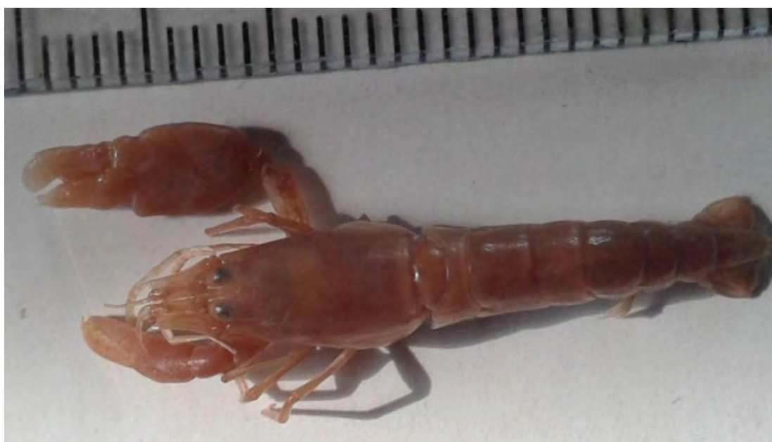
Fig. 2 Photo of the snapping shrimp of A. edwardsii (Audouin, 1826), side view of the male, in MSC.

A. Edwardsii was recorded in the Western Indian Ocean; Gulf of Mannar; Piearl Banks in Ceylon; Indonesia; New Caledonia and Sandwich Islands; Indo-West Pacific (Red Sea to New Zealand and Hawaii); Hawaii (Tiwari, 1965). It is one of the migratory species through the Suez Canal as it was recorded for the first time in the Mediterranean Sea in Egypt in 1924. It spreads in the Indian Ocean and western Pacific Ocean and the Red Sea and rcored in Syria (Al Hatoom, 2008).