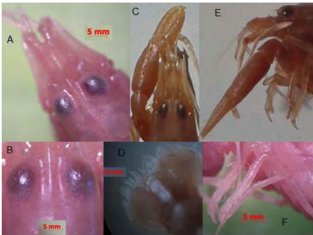
Fig. 4 Some of the important parts taxonomic shrimp A. edwardsii ; A,B: anterior region, dorsal view; C,E: dorsal and lateral view of anterior region; D: telson and uropods; F: third pereopod.