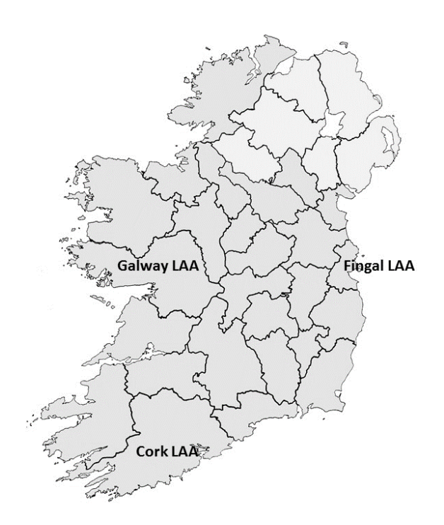
Fig. 1 Location in Ireland of the local authority areas of Galway, Cork and Fingal where samples were collected for this study.

minutes. The supernatant was removed to a clean tube and stored at -20°C for further use.